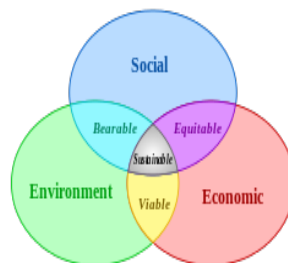
Figure 1 "3 pillars of sustainability", in which both economy and society are constrained by environmental limits