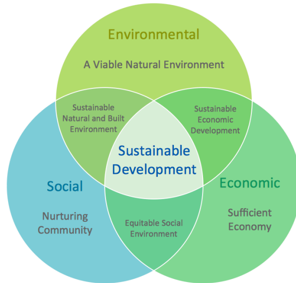
Figure 1 VENN Diagram: Show in the circles where the US and the other countries stand on the pillars of sustainability