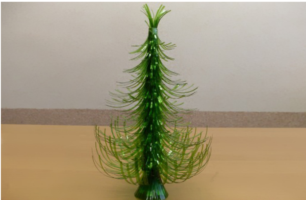
Figure 4 completed Christmas tree