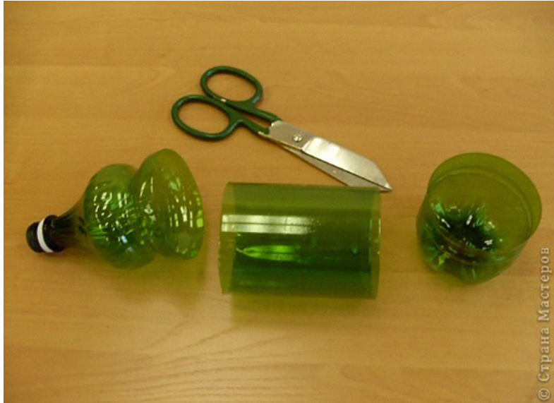
Figure 1 cutting plastic bottle into 3 pieces